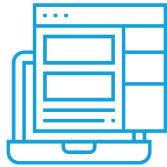
Organized & Customizable Dashboard